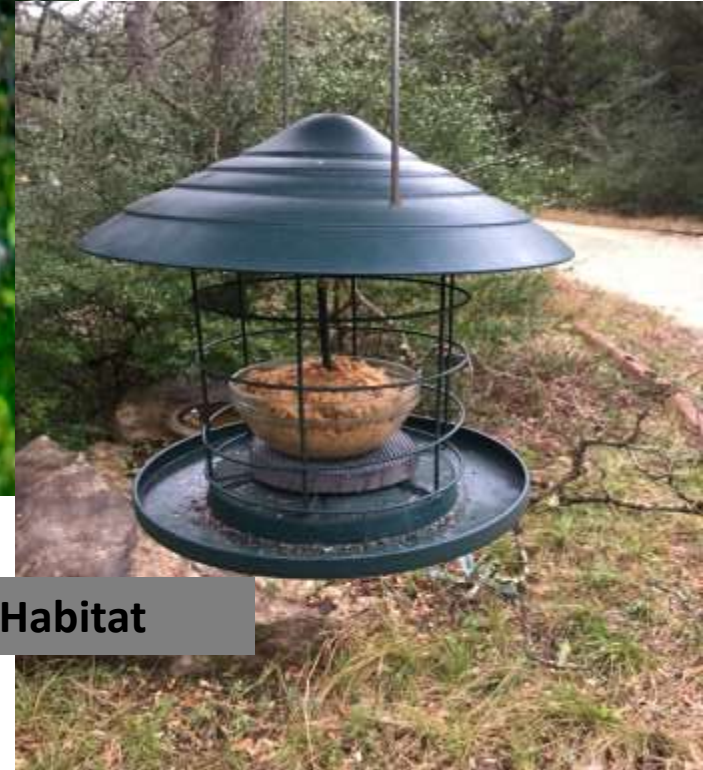
The Three Requirements for Good Habitat