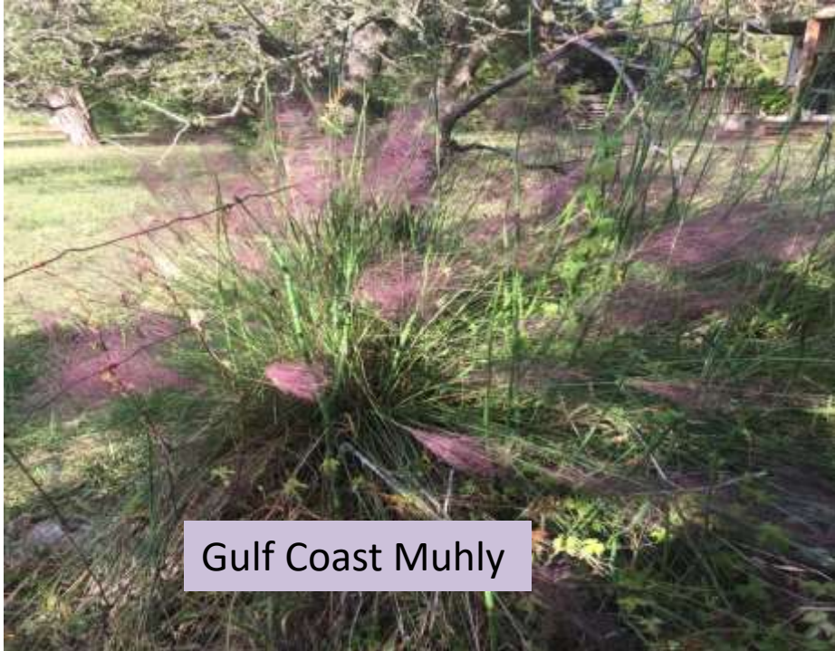
Gulf Coast Muhly