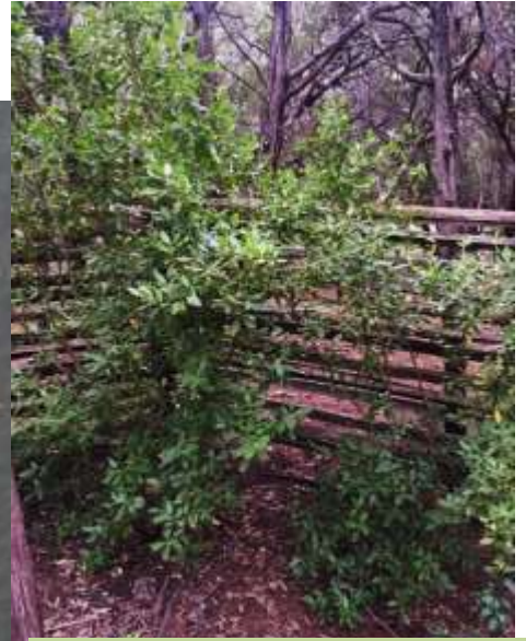
Lindheimer Silk Tassel