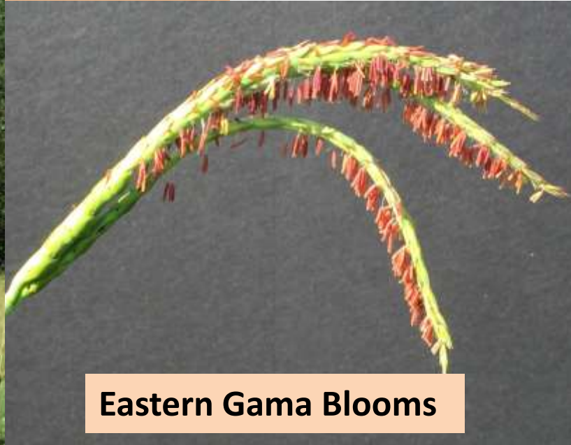
Eastern Gama Blooms