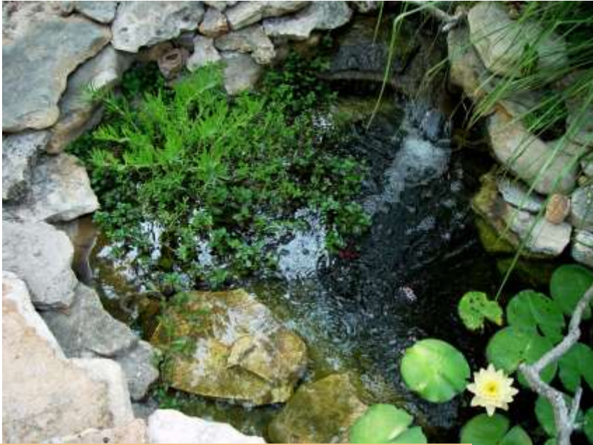
Notice shallow rock placement