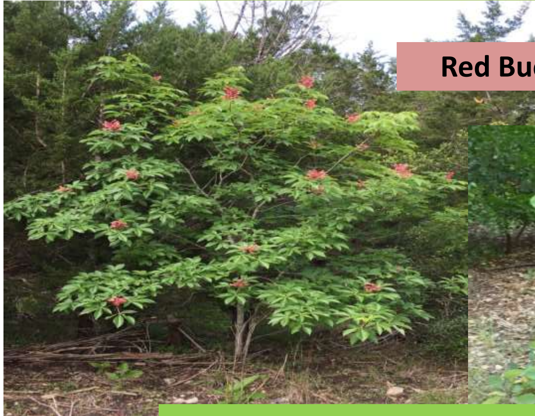
Red Buckeye or Aesculus pavia