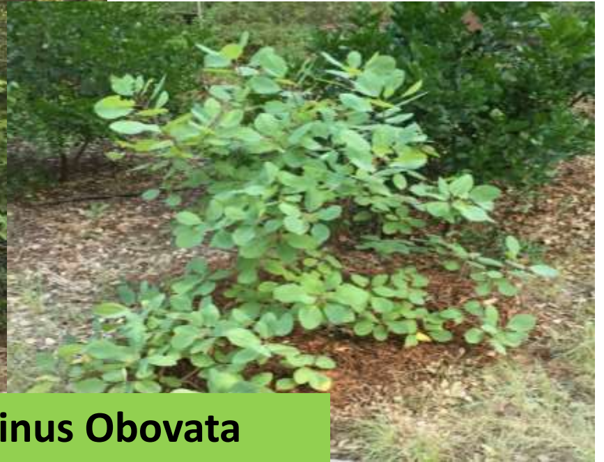
Smoke Tree or Cotinus Obovata