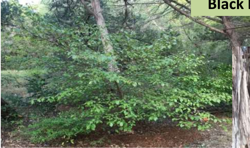
Black Haw Viburnum or Prunifolia