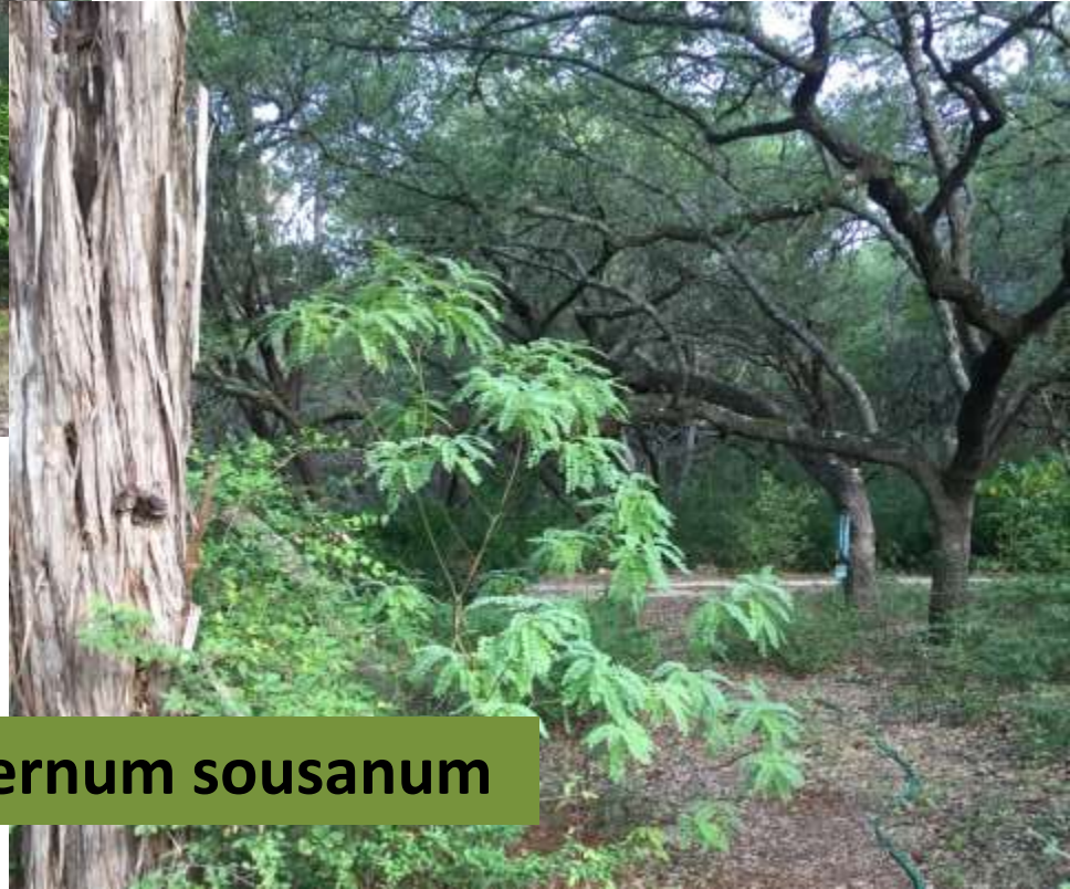
Arroyo Sweetwood or Myrospermum sousanum