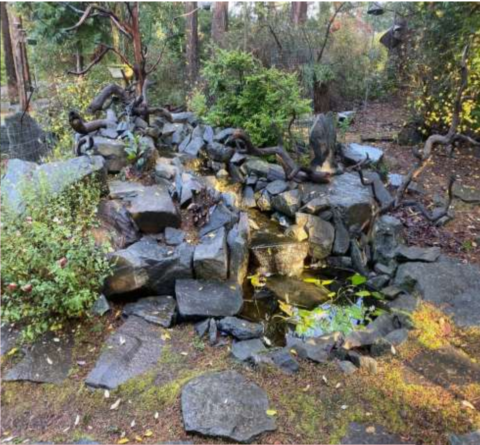
Notice rocks in stock tank and branches around water feature