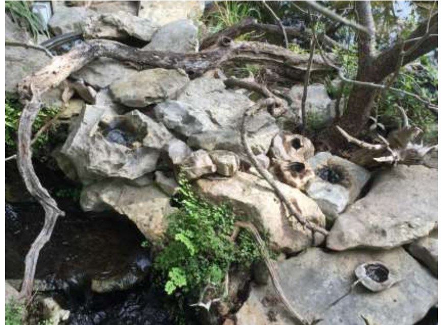
Small rocks with depressions loved by small birds